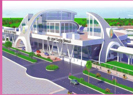
KILAMBAKKAM NEW BUS TERMINUS