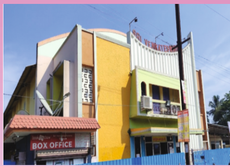
SRI VENKATESWARA THEATRE