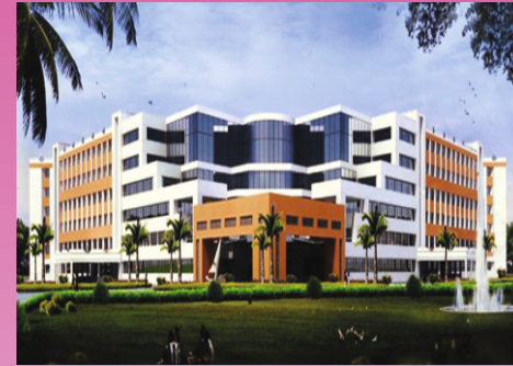
SHRI SATYASAI MEDICAL COLLEGE AND HOSPITAL