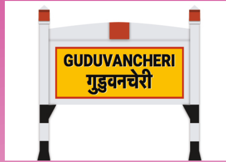
GUDUVANCHERI RAILWAY STATION