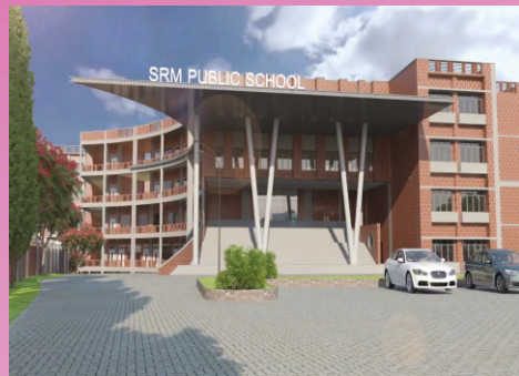
SRM PUBLIC SCHOOL