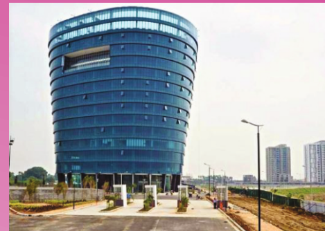
L & T ESTANCIA SEZ