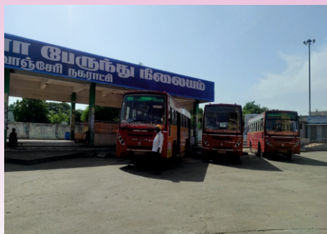
GUDUVANCHERI BUS STOP